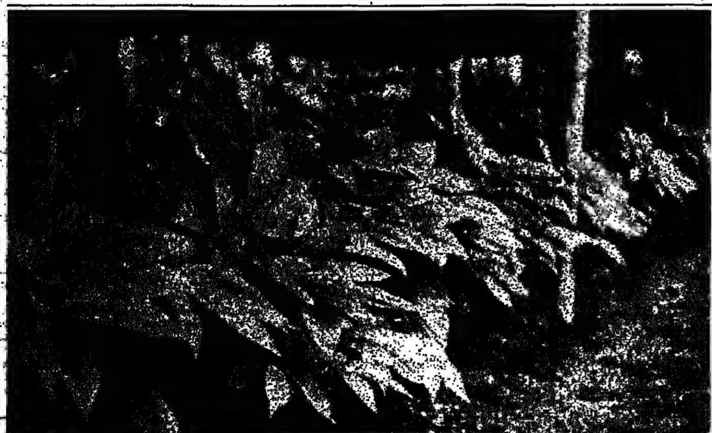
Cultivated ginseng grows and blooms under shade provided by reed laths.